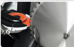
MACHINING THE TOOTH FACE DURING SHARPENING PROCESS