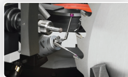
MEETING THE ORIGINAL OEM SPECIFICATIONS