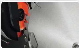
MACHINING THE CLEARANCE SURFACE IN A PERIPHERAL GRINDING PROCESS