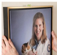
Press to Mark Wall