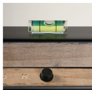
Attach Level & Bumper