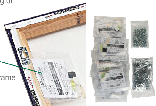
Bulk Package - Brackets attached at factory Customer take home hardware kit attached to frame