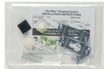
Complete Package - Single Frame