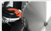
MACHINING THE TOOTH FACE DURING SHARPENING PROCESS