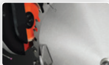
MACHINING THE CLEARANCE SURFACE IN A PERIPHERAL GRINDING PROCESS