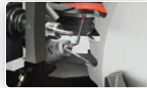
MEETING THE ORIGINAL OEM SPECIFICATIONS