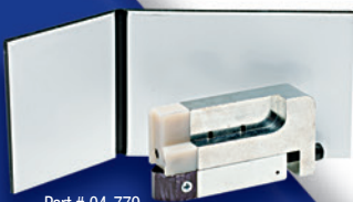
Part # 04-779

Since 1868, Fletcher-Terry has revolutionized advanced cutting solutions for numerous global industries. Our versatile FSC™ Multi-Material Cutter features an interchangeable cutting head design ensuring that this machine will never become obsolete, as Fletcher upgrades its blades to match new substrates as they enter the market. The FSC cuts aluminum composite and aluminum sheet materials, debris-free, enabling you to place it in the same work area as your dust-sensitive printing device.