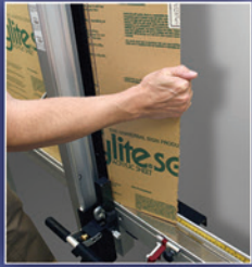
Acrylic Scoring & Breaking